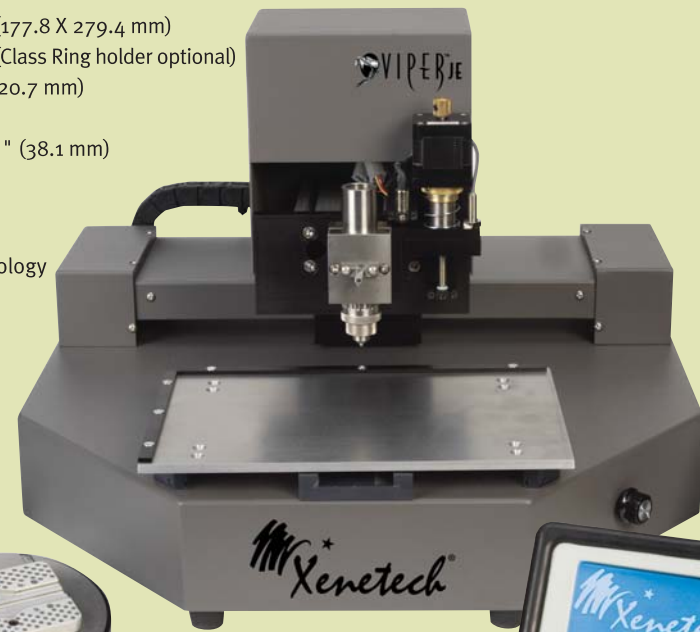
7"x11" ENGRAVING TABLE