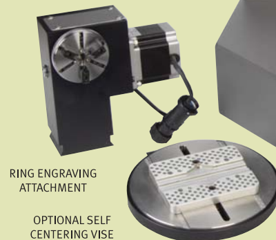
RING ENGRAVING ATTACHMENT