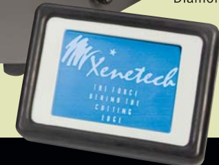
COLOR TOUCH SCREEN KEYPAD